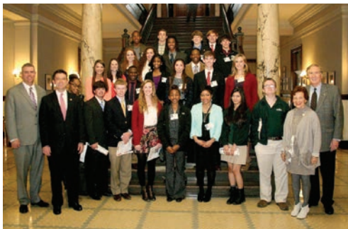
2013-14 YL Class

school administration in Madison County plus New Summit School and Jackson Academy is asked to select (2) of the best and brightest juniors to represent their respective school. These students should be not only academic but well rounded participating in either sports, music, extra-curricular activities, community service or leadership. The Youth Leadership Committee has added another requirement for the 2014-15 class – the student must reside in Madison County! Letters to the high school administration will be mailed in late July or early August asking for representatives for this fall's program.