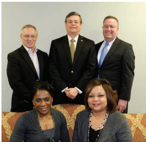
2014-15 YL Committee