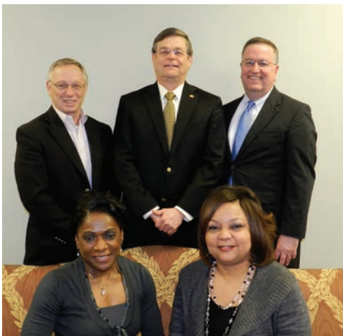
2014-15 YL Committee