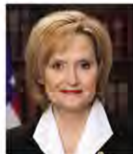
The Honorable Cindy Hyde Smith United States Senate

Madison County Business League & Foundation &