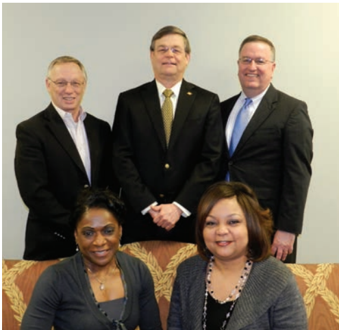
2014-15 YL Committee