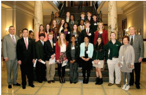
2013-14 YL Class

school administration in Madison County plus New Summit School and Jackson Academy is asked to select (2) of the best and brightest juniors to represent their respective school. These students should be not only academic but well rounded participating in either sports, music, extra-curricular activities, community service or leadership. The Youth Leadership Committee has added another requirement for the 2014-15 class – the student must reside in Madison County! Letters to the high school administration will be mailed in late July or early August asking for representatives for this fall's program.