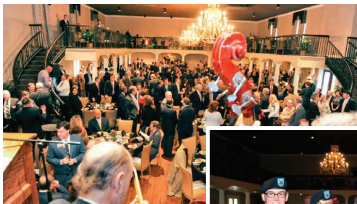
MCBL&F 2016 League & Legislature Luncheon at the Old Capitol Inn