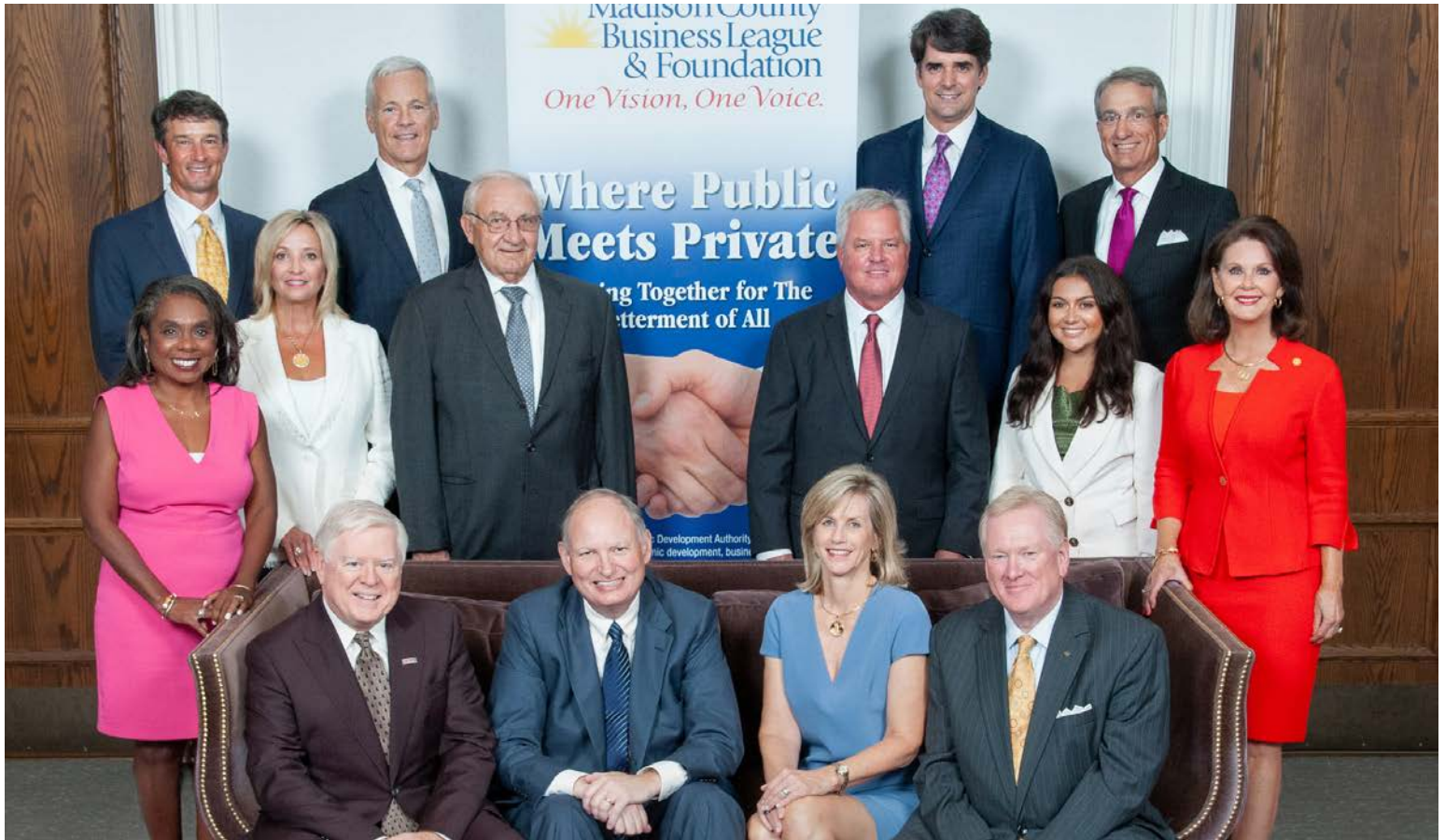
(Top Row - Pictured L:R)