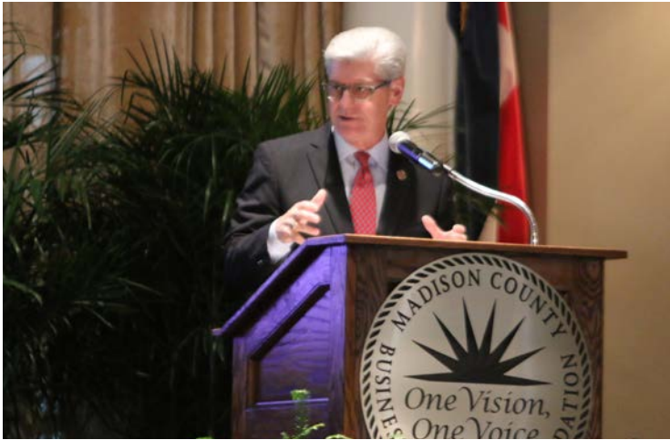
Governor Phil Bryant.