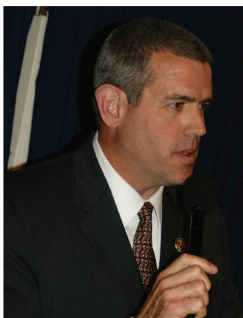
Pictured Speaker of the House and Madison County Representative Philip Gunn

The Madison County Business League hosted the 2012 "LEAGUE & LEGISLATURE" luncheon at the Mississippi State Capitol on Wednesday, March 21st catered by VIP Grand Events.