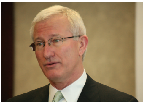
Photo of former Governor Ronnie Musgrove- motivational speaker at the YL breakfast