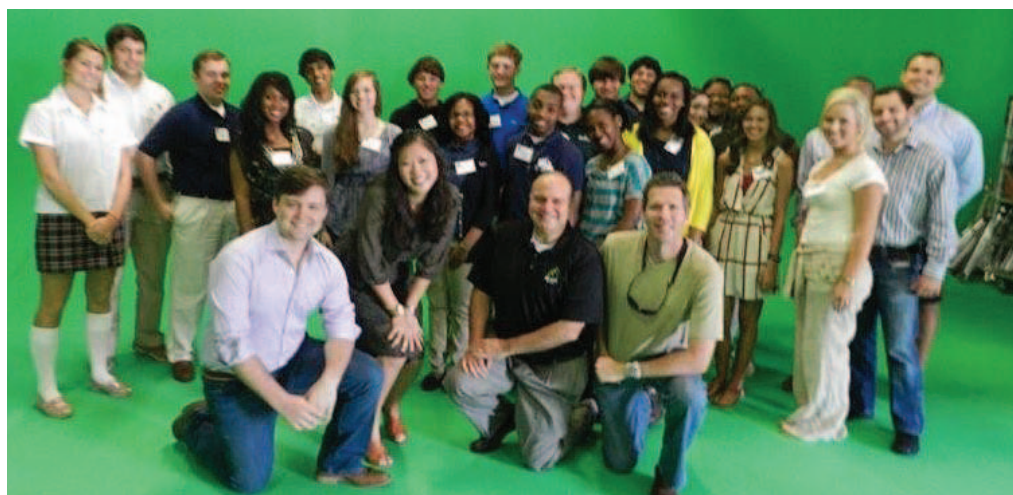
Group shot at Mad Genius in front of green screen.