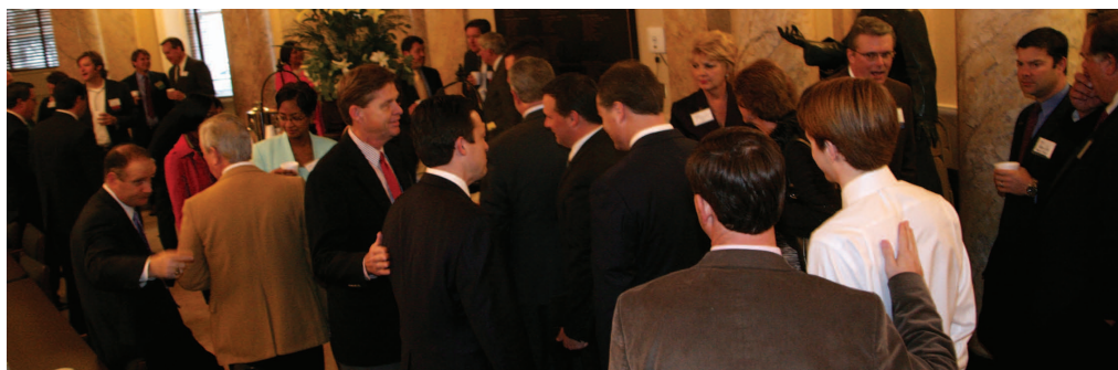
Business League members networking with members of the MS state legislature.