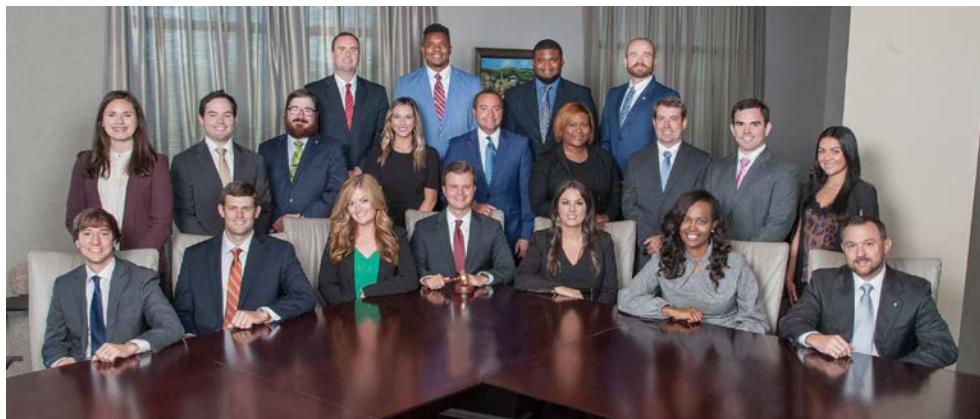
Madison County Business League & Foundation Announces 2021-22 Young Professional Steering Committee & Officers.