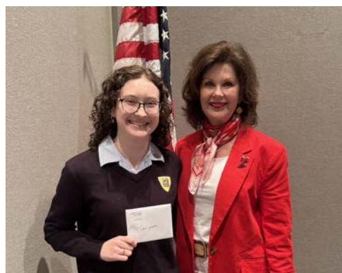
ST. JOSEPH CATHOLIC SCHOOL