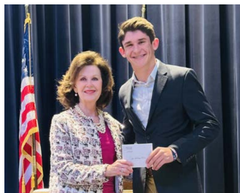
ST. ANDREWS EPISCOPAL SCHOOL