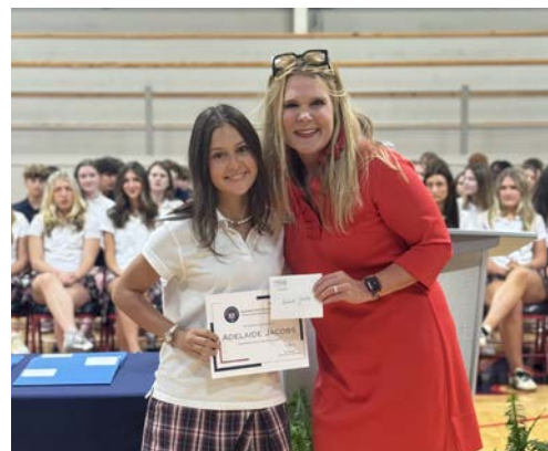
MADISON RIDGELAND ACADEMY