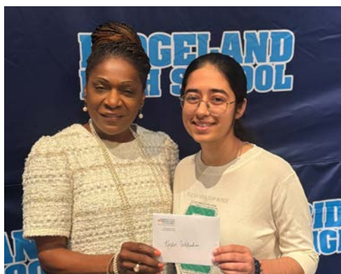
RIDGELAND HIGH SCHOOL