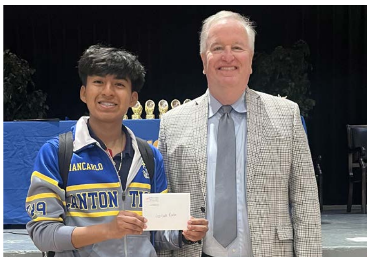
CANTON HIGH SCHOOL