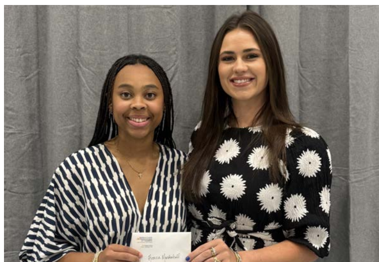
GERMANTOWN HIGH SCHOOL