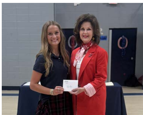
TRI COUNTY ACADEMY