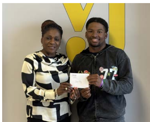
VELMA JACKSON HIGH SCHOOL