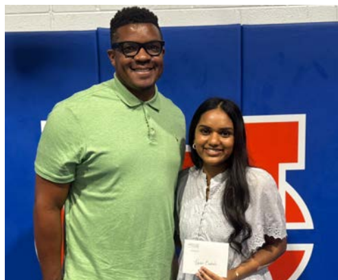
MADISON CENTRAL HIGH SCHOOL